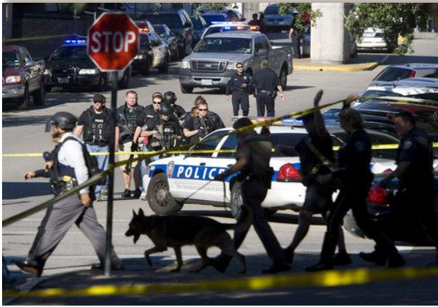
Figure 6 K-9 unit conducting campus search

At approximately 12:20 p.m., unified command shrank the perimeter as buildings were searched and cleared of any suspects. They also developed a demobilization plan that included a staggered release of students, faculty, and staff inside buildings. UTPD used the siren system voice over to direct the release of the community starting with the north side of campus. The command post was closed at approximately 12:45 p.m.