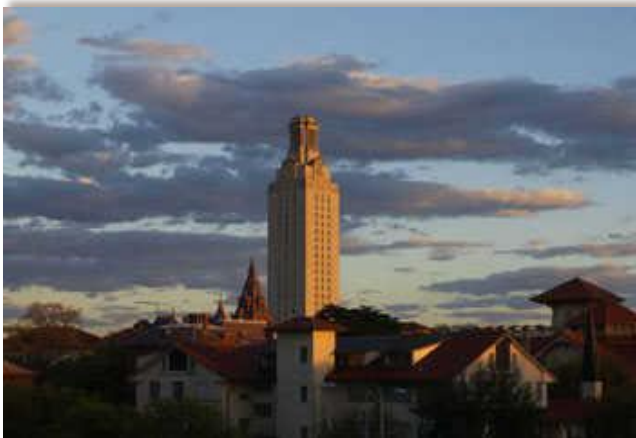
Figure 2: The university Tower at sunrise

The university's reach goes far beyond the borders of the main campus with satellite campuses and research centers across Texas, including the J.J. Pickle Research Campus and the Brackenridge tract in Austin, the Marine Science Institute in Port Aransas, and the McDonald Observatory in Fort Davis, Texas.