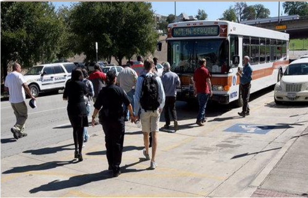
Figure 7: Witnesses boarding a Capitol Metro bus

Officers identified 17 witnesses and moved them to a secure location inside of Gregory Gym, which was adjacent to the incident command post. The APD commander apprised the UTPD sergeant of the assets APD could provide to assist, including a Capital Metro bus and 15 homicide detectives. A plan was made to bus the witnesses to the APD Main Headquarters (less than 1.5 miles away) where the detectives would take statements. While the bus was en route to pick up the witnesses, three UTPD detectives took verbal statements from the witnesses. The detectives tried to determine if there was credible information regarding a second suspect. The witness statements varied but were similar enough to believe there was only a single gunman.