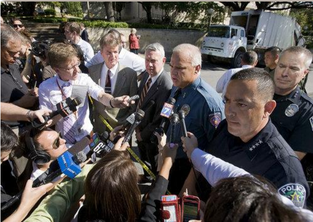
Figure 13: President Bill Powers, Mayor Lee Lefingwell, UTPD Chief Robert Dahlstrom, and APD Chief Art Acevedo conduct a press conference near the scene

The next press conference was conducted at approximately 1 p.m. at the AT&T Executive Education and Conference Center. This location was one of two locations (LBJ Library is the second location) pre-chosen for press conferences for any major event on campus. These locations were chosen because the buildings are equipped with the necessary technology, parking is accessible to satellite trucks and other press vehicles, and both locations are also on the outer edge of campus for easy ingress and egress for the press corps.