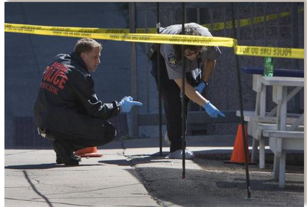
Figure 8: APD and UTPD Officers collecting evidence

A UTPD detective then went to the PCL video room to view the security footage and determine if one or more shooters entered. Staff members from Information Technology Services (ITS) and PCL assisted with obtaining the video footage that verified that only one person with a gun had entered.