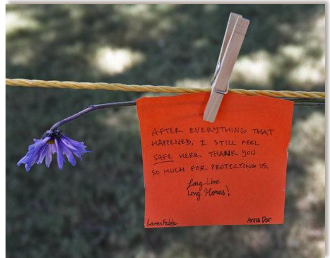
Figure 16: Thank you notes to law enforcement line the campus West Mall

The overarching reason for the successful management of this event was made clear in every area's review—effective collaboration among multiple law enforcement agencies made possible by regularly training together. Training facilitates these working relationships. This report also identified many lessons learned, and we have started to address the challenges and implement some of the recommendations as they relate to personnel, training, procedures, equipment, and technology.