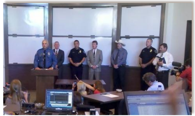
Figure 14: UTPD Chief Robert Dahlstrom speaks to the media at a press conference in the AT&T Executive Education and Conference Center

Over the next two days, the UTPD Chief of Police conducted approximately 10 interviews each day. Most news stations preferred a one-on-one interview.