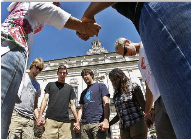
Figure 15: Students gather for vigil September 29