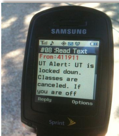
Figure 11: UT text alert

The first emergency call was reported to the UTPD Communication Center at 8:12 a.m. UTPD has two operable dispatch consoles. The primary dispatcher received the first telephone call and the second dispatcher assisted. All units were dispatched immediately. The center was inundated with telephone calls, so additional personnel were summoned to answer calls. The two communication operators concentrated on radio traffic. UTPD had previously trained civilian personnel so in the event of an emergency, they could assist and they did.