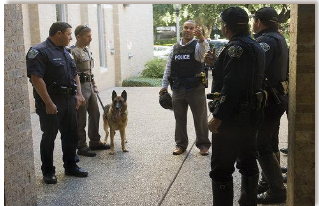
Figure 3: Search team prepares to enter Jester residence hall