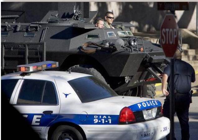
Figure 4: Officers in an APD emergency response vehicle—an “armored bear cat”